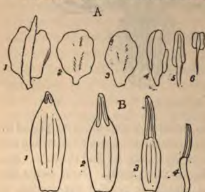
Fig. 2. STAMENS CHANGING TO PETALS.

The case for the full substantiation of Goethe's maxim grows strong